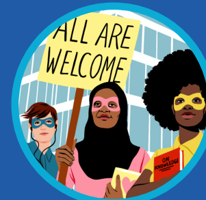
Give to the Max Day November 15, 2018

After being closed for a 14-month renovation, Ridgedale Library re-opens to an enthusiastic crowd of Library supporters at a special ribbon-cutting ceremony. The updated space includes eight new meetings rooms, new family and collaborative work spaces, and large windows that flood the space with natural light.