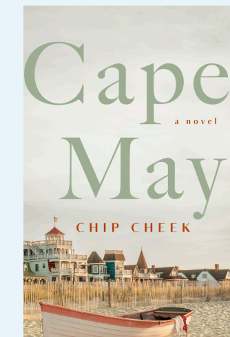
Cape May by Chip Cheek