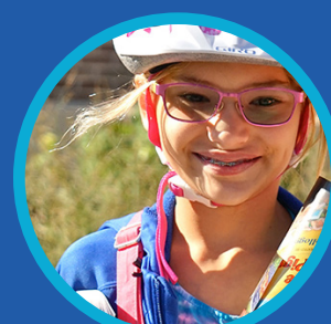
Summer Learning at HCL June-August, 2018