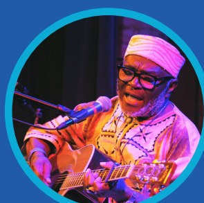
MnSpin Live Concert August 21, 2018

Combining the joy of summer fun with educational experiences, Hennepin County Library provides experiences that keep children discovering, engaging, and learning during the summer months. Programs focus on STEM, art, and literacy, and engage thousands of youth participants annually.