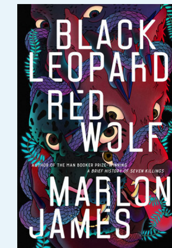
Black Leopard, Red Wolf by Marlon James

For more specially curated reading lists visit: hclib.org/browse/staff-reviews-featured-lists