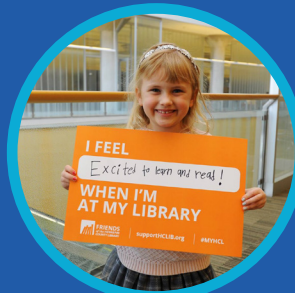
National Library Week April 8-14, 2018

TESTIFY: Americana from Slavery to Today opens in Cargill Hall at Hennepin County Library-Minneapolis Central. The collection of art and artifacts from the Diane and Alan Page Collection aims to re-frame the conversation about racial justice.