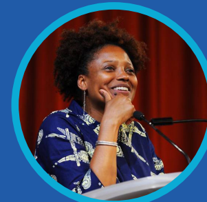
Tracy K. Smith @ Talk of the Stacks May 16, 2018

Colson Whitehead, 2017 Pulitzer Prize-winning author of The Underground Railroad , shares stories about his life and writing to sold-out crowds at the Pen Pals Author Lecture Series, held at Hopkins Center for the Arts.