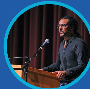
Colson Whitehead @ Pen Pals February 1, 2018