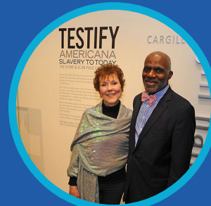
TESTIFY Exhibit Opens January 11, 2018

HCL announces a new plan for automatic renewals to help make it easier for patrons to manage their library account. More time to read and enjoy more books - one of the many reasons we love HCL!