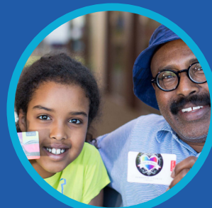
Automatic Renewals at HCL January 1, 2018

Thank You, Friends, for Making 2018 a Year to Remember