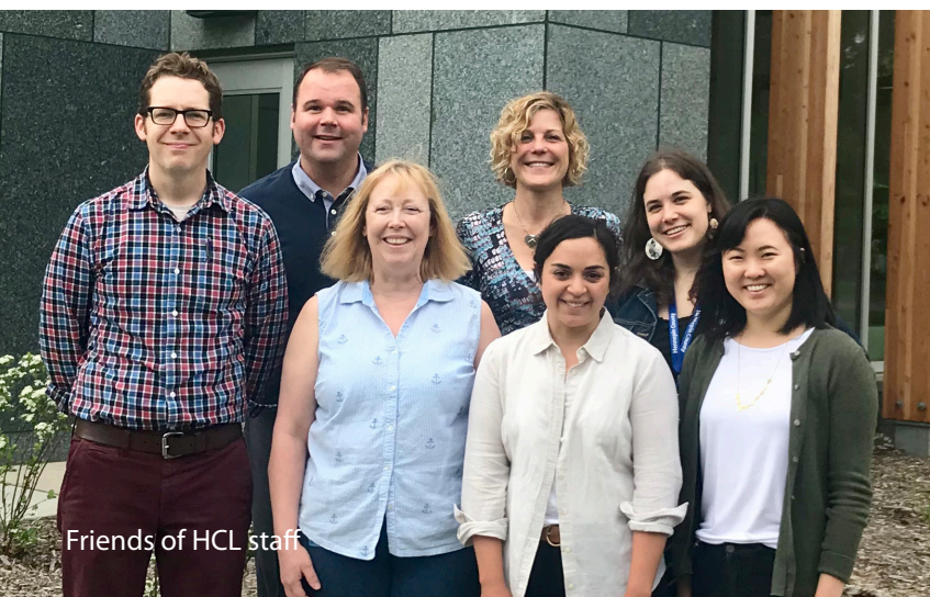
Friends of HCL staff